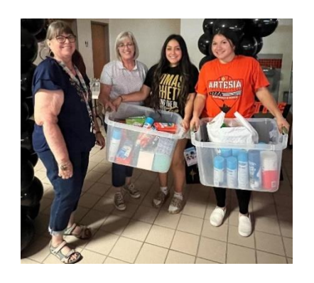
Artesia High School Student council planned a movie night for students'. Attendance was free with a donation to Haven of Hope.