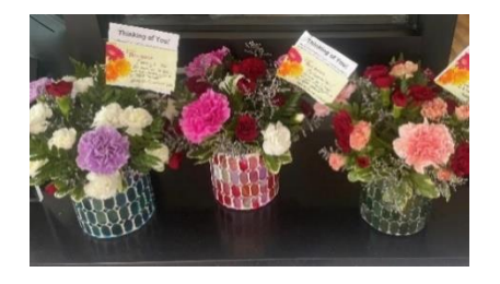
Hermosa Church of Christ brightened the cottage by donating flower arrangements for each mom.